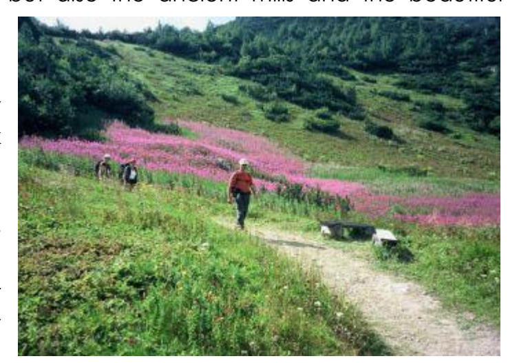
in Picture 5 Hiking in Slovakia

Hiking tourism is a very prospective area of the Slovak industry; tourism the total length of marked footpaths is more than 14 000 km. More than 95% of these marked hiking trails are in the hilly part of the country (http://www.telecom.gov.sk/index/index .php?ids=119830). Hiking Slovakia is popular due to the